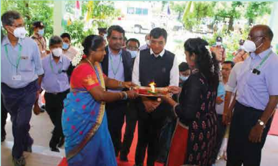
Hon'ble Union Cabinet Minister of Health & Family Welfare and Chemicals & Fertilizers, Dr. Mansukh Mandaviya visited MFL Plant on June 26, 2022