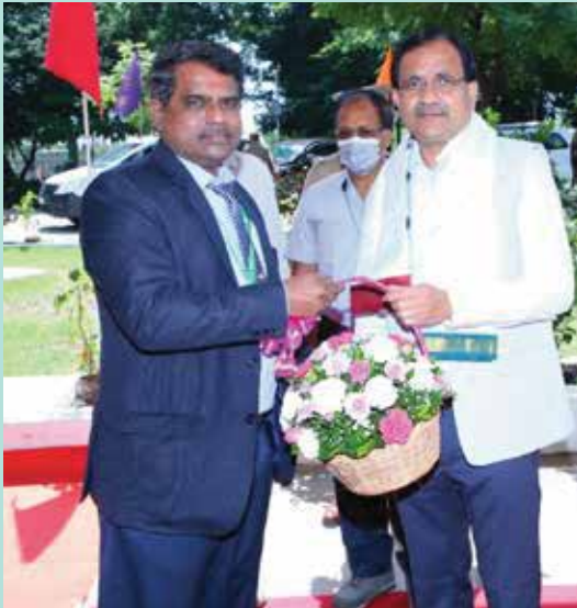
Hon'ble Union Minister of State for Chemicals & Fertilizers and New & Renewable Energy, Shri Bhagwanth Khuba visited MFL Plant on August 22, 2022